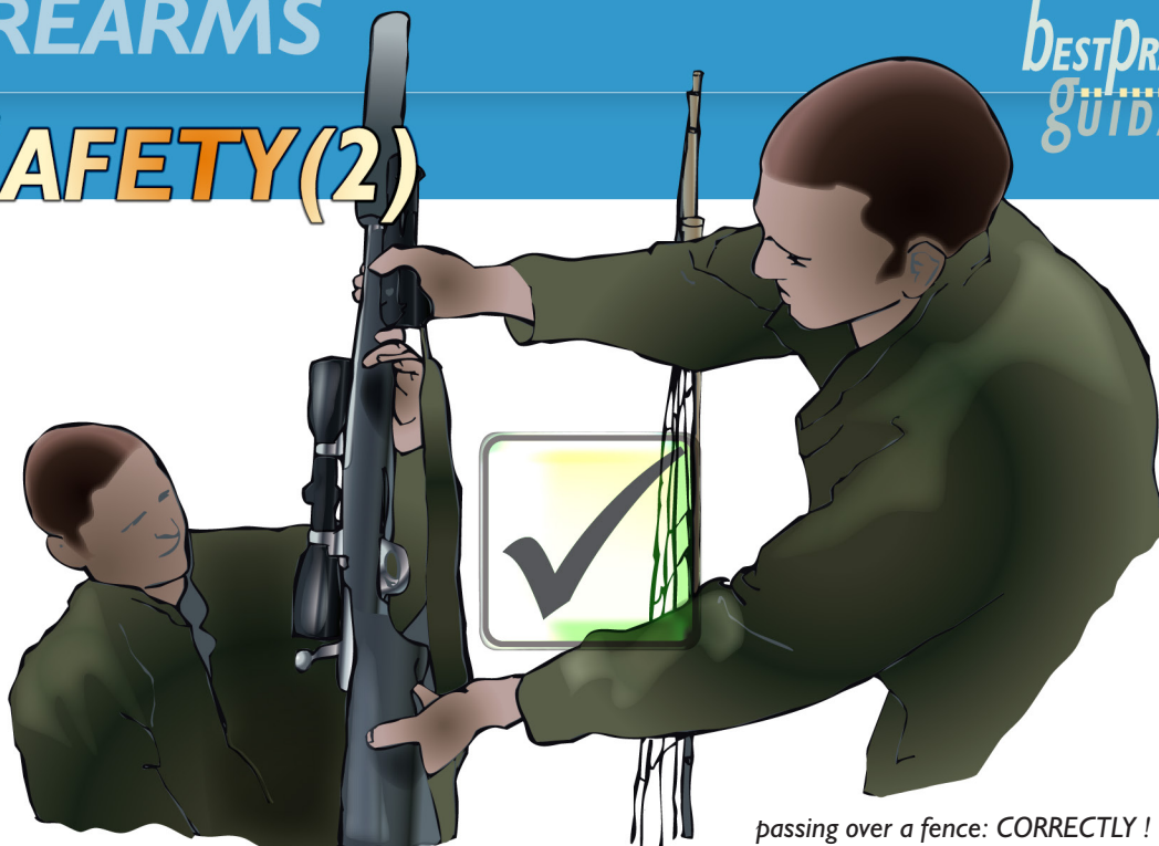
passing over a fence: CORRECTLY ! (note bolt is open)