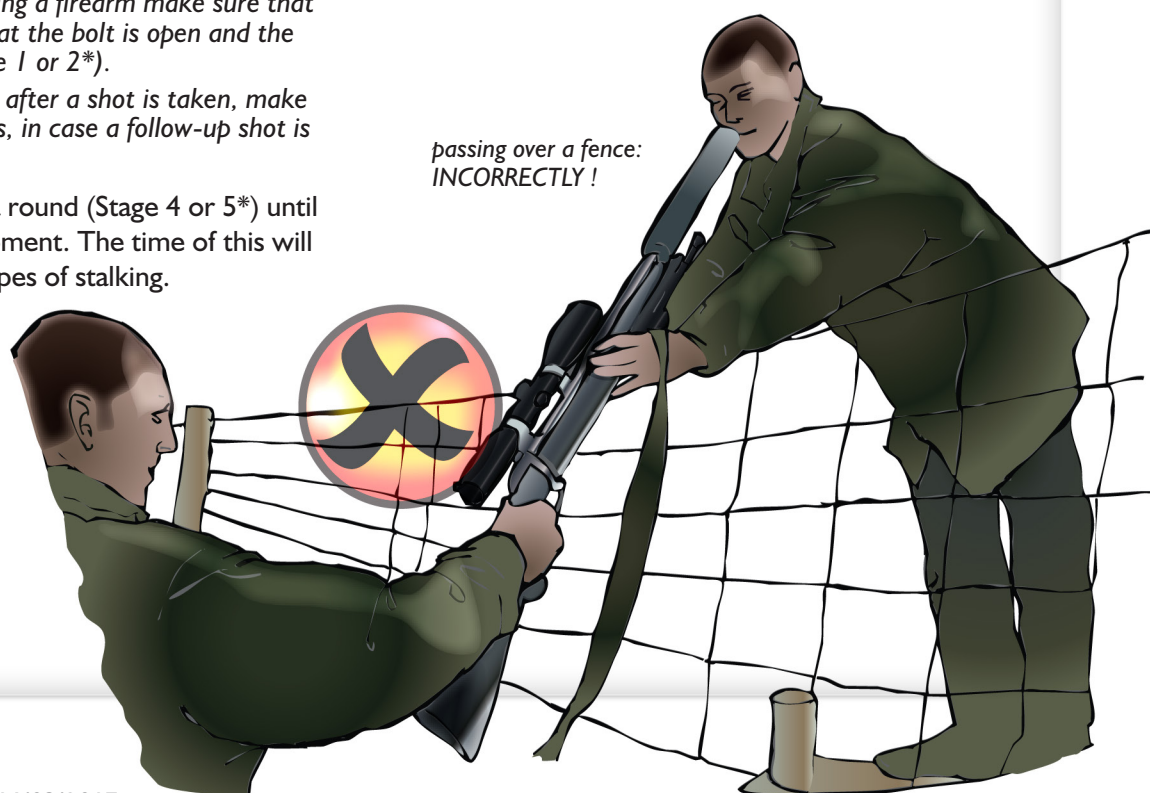
passing over a fence: INCORRECTLY !